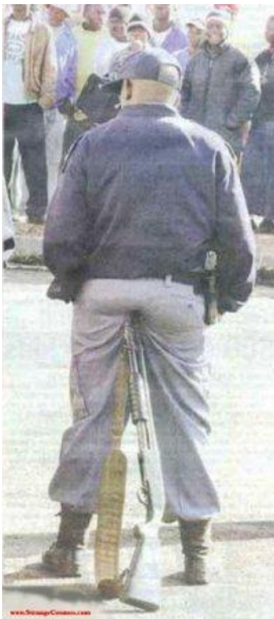
Big brother watching you