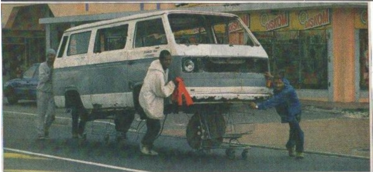
VOETSTOETS: Infamous for their driving skills, it's long been suspected that some taxi drivers are off their trolleys. And pirate taxis are notoriously held together with a string and a prayer. But supermarket trolleys for wheels? This innovative group was spotted in Military Road, Steenberg. They insisted they were not on their way to a nearby taxi terminus.