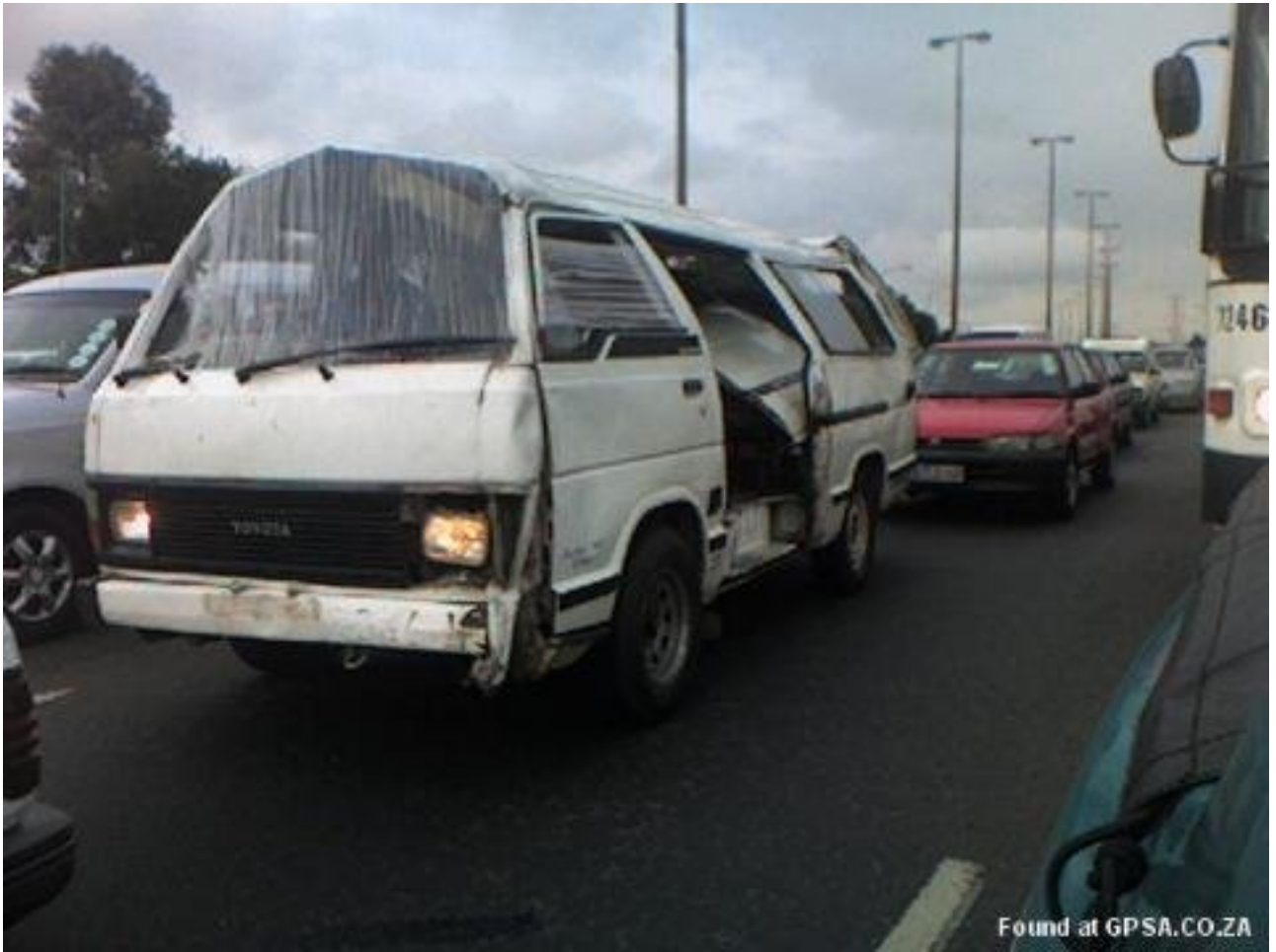
Getting home by taxi.