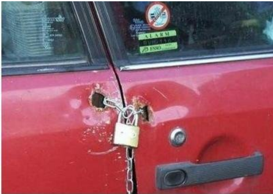
Car sharing? No thanx!