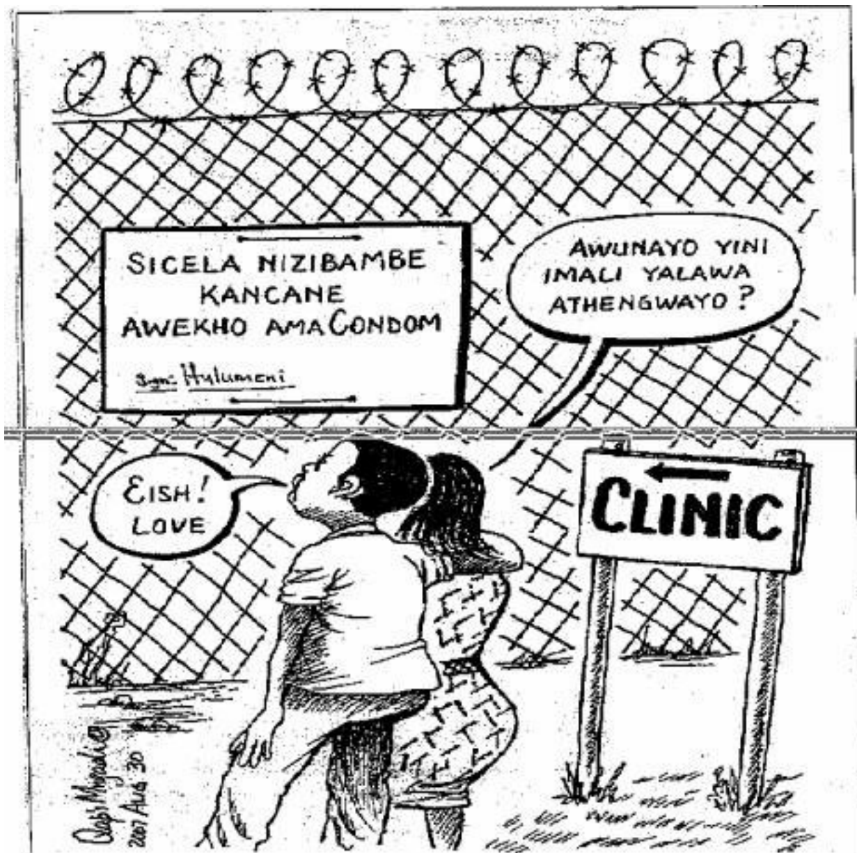
Kindly abstain for a while - condoms currently out of supply. (Signed: The Government) “Don’t you have money to buy us some?” “Unfortunately not, my dear!”