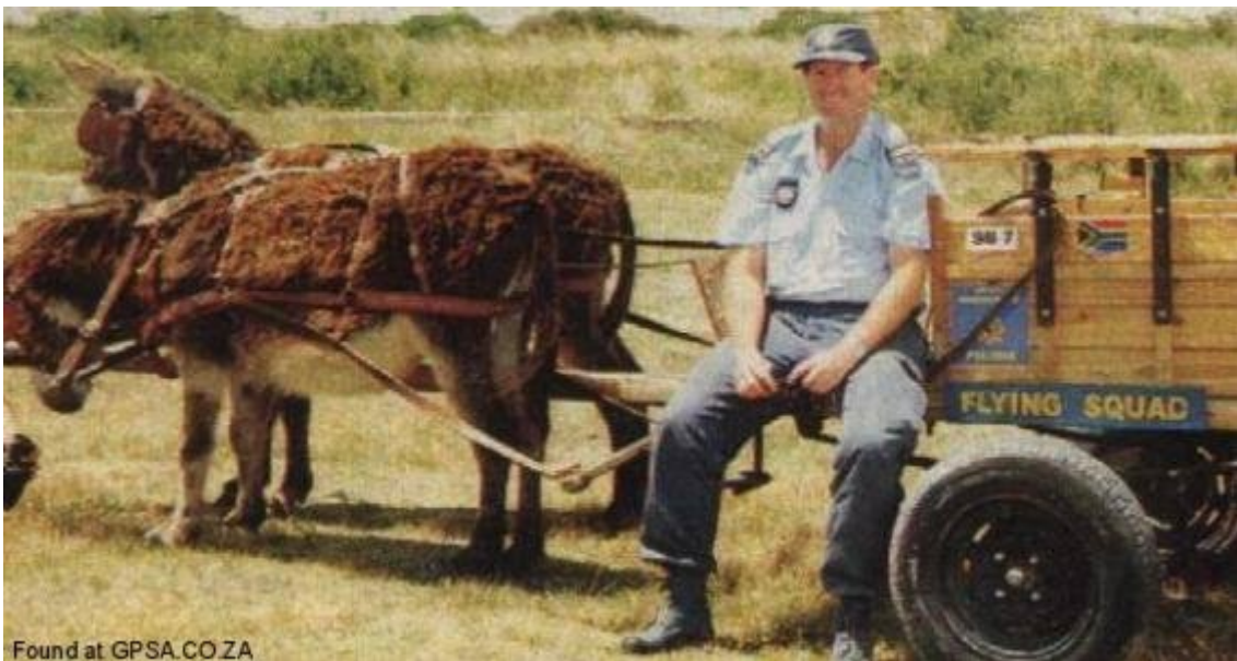
Flying squad - against crime.