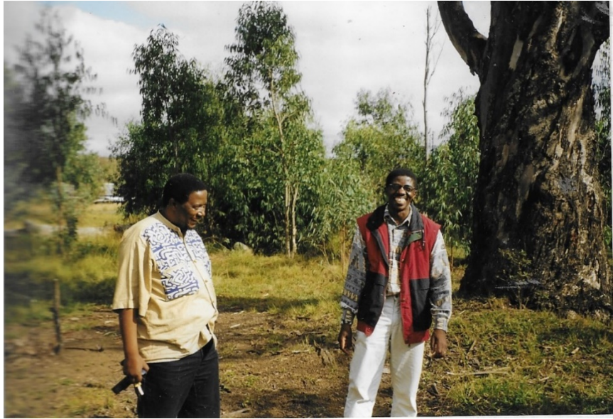
Bei den Ruinen und Familiengräbern in KwaBhanya: 26.04.1999