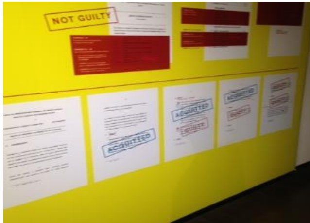
Exhibition Panel Displaying the Counts of which Dr Basson has been Found Guilty

The long saga of demanding accountability from Dr Wouter Basson as a physician who accepted the command and oversight of the CBW programme he was tasked with setting up and managing, continues 16 years after the laying of complaints against him by forty professional colleagues.